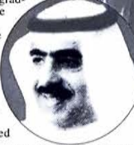
■ Shaikh Mohammed bin Khalifa

★ DEFENCE Minister Shaikh Khalifa bin Ahmed Al Khalifa , 56, has a bachelor's degree in military sciences from Britain's Sandhurst Military Academy and a Master's degree in military sciences from the Staff and Commanders College in the UK. Shaikh Khalifa joined the BDF as an officer and has occupied several high offices in its units before his appointment to his current post in 1988. He is the recipient of several Bahraini and international awards.