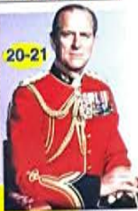
Philip branded Di 'a harlot' 20-21