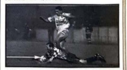
Last week's competition with the ball showing