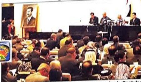
■ Iraq's parliament meets in an emergency session in Baghdad automatic weapons fire from an Israeli tank, they said. Full report – Page 15

A final decision on the resolution passed unanimously by the UN Security Council last week will lie with the Revolutionary Command Council, Iraq's highest authority which is led by President Saddam Hussein.