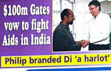
$100m Gates vow to fight Aids in India