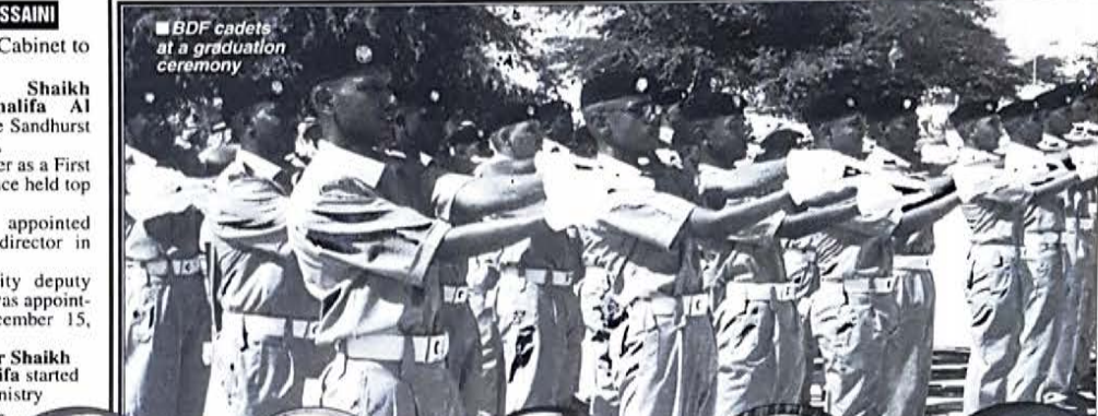
■ BDF cadets at a graduation ceremony

He was appointed Labour and Social Affairs Minister in 1971 and Minister of