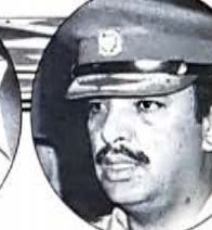
■ Shaikh Khalifa