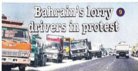
Bahrain's lorry drivers in protest 9