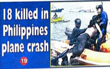
18 killed in Philippines plane crash 19