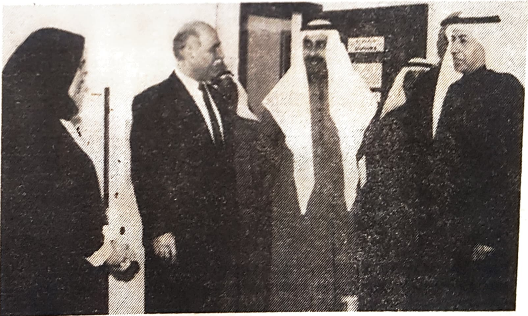
■ VISIT ... Labour and Social Affairs Minister Abdulnabi Al Sho'ala accompanied by senior ministry officials yesterday paid a visit to the Child Care Society. He praised the services provided by the society.