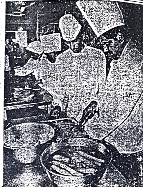
Students under training ... bright futures

He said the hotels in Bahrain would be delighted to extend all support to the new management of HCTC.