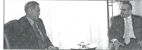
■ Crown Prince, Deputy Supreme Commander and Economic Development Board (EDB) chairman Shaikh Salman bin Hamad Al Khalifa yesterday received at his re- sidence in Singapore Singaporean Education Minister and Second Minister of Defence Dr Ng Eng Hen. They discuss co-operation in education and training. Ties boost – Page 26