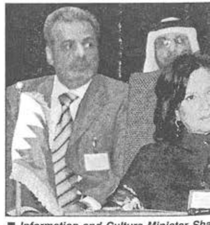
■ Information and Culture Minister Shaikh Khalifa bin Dalj Al Khalifa yesterday spoke on the sidelines of the 15th GCC summit, hailing the proposed Unesco regional heritage as a Gulf and Arab gain and contributing to the region's growing political and economic integration.